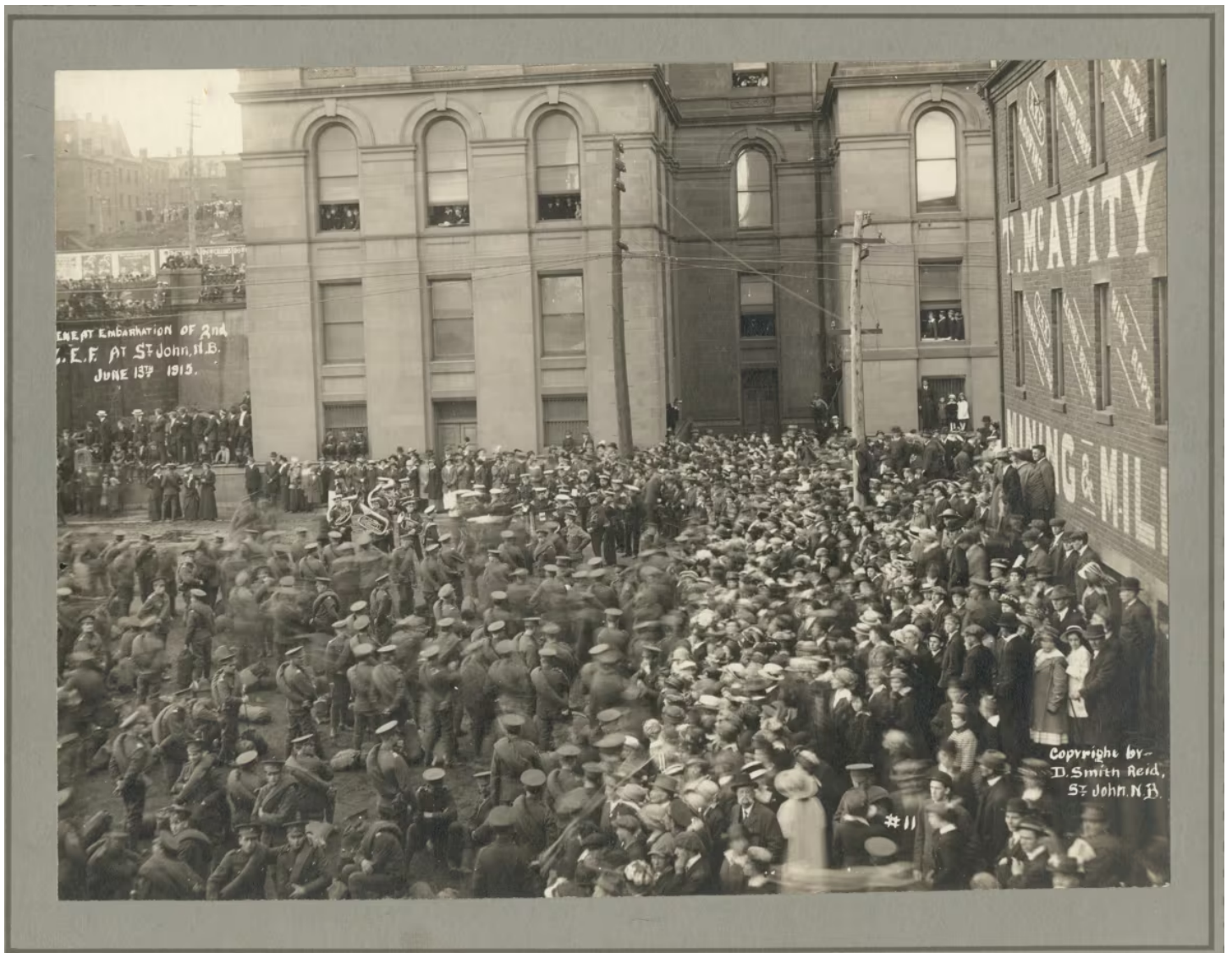
The crowd in Saint John sees the 26th Battalion off to Europe on June 13, 1915.