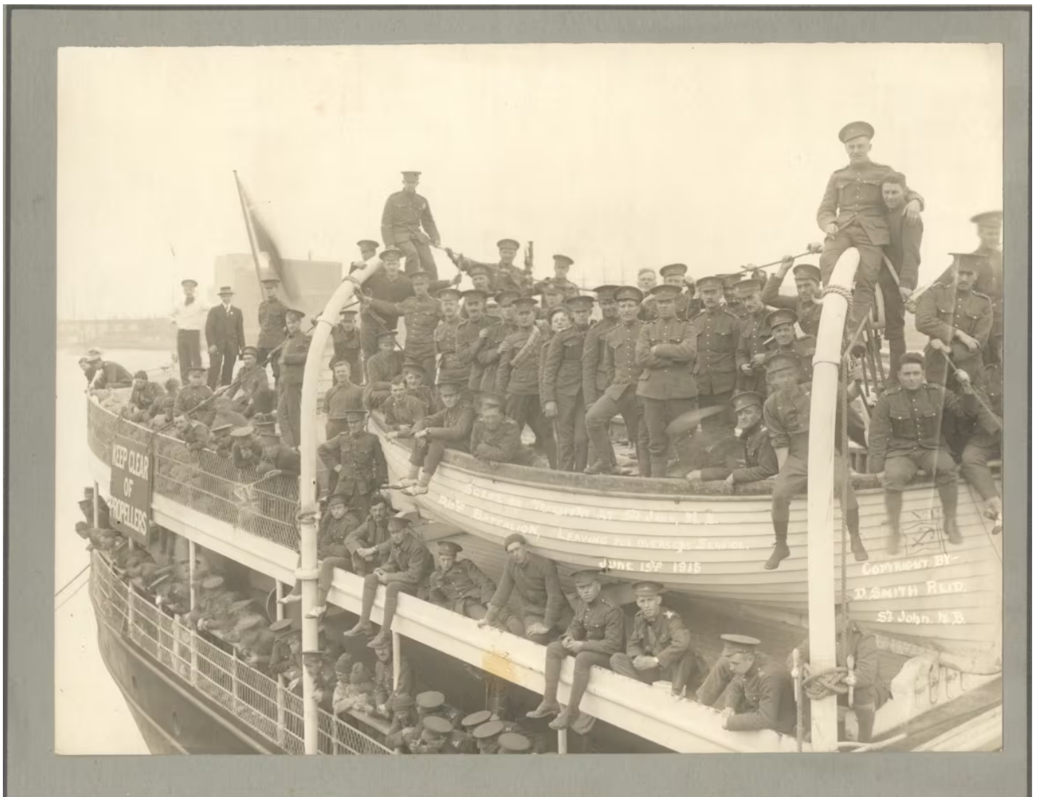
The 26th Battalion leaving Saint John for England aboard S.S. Caledonia, June 13, 1915.